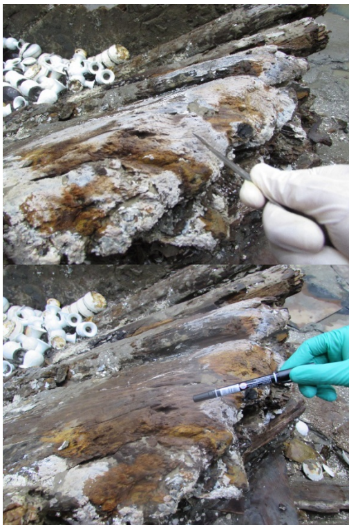
Fig.2 Before using K100(left) and keep using K100 for 10 months(right)

combined with a cloning library, we found that in the early stage of excavation, there were a large number of fusarium in the hull. Fusarium is problematic because it destroys cellulose. After a series of screening studies, we used K100 to deal with the microbes in the hull. After more than a year of use, the on-site microbial control work has been positive, lots of the fusarium has been eliminated. For now, the sterigmatocystin in the hull is the dominant microbe, this kind of microbe causes minor damage to the hull. On this basis, we upgraded the automatic spray system, and put antibacterial agents into the spraying solution, thus improve the on-site work efficiency and conservation effect.