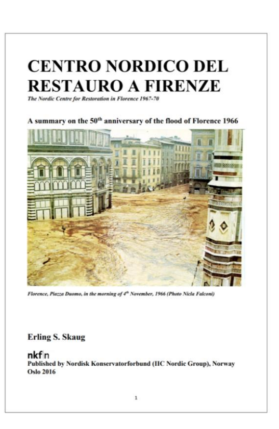
Image retrieved from the manuscript's open access <u>page</u>. Image by the Nordic Centre for Restoration in Florence.

With the understanding that preserving the cultural heritage of Florence was a global responsibility, the idea to create a Nordic rescue project was formulated. Three Nordic envoys arrived Florence soon after the flood receded with the mission of setting up communication with the city's authorities and evaluating Florence's need for assistance.