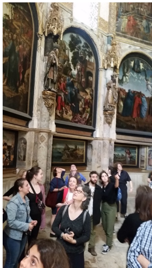
Convento de Cristo (visit Social program)