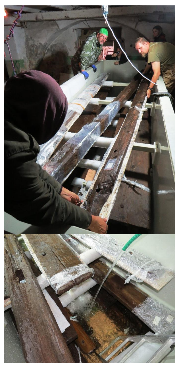
Fig. 8 and 9: Temporary storage in water tanks

After disassembling the lednik into its component parts, it became obvious that the details of other wooden constructions used in the lednik were possibly parts of ships and barges. For example, most of the floorboards correlated with the 2-inch ship deck boards (a "board type"—in English classification). Numerous fragments of iron nails and pegs (treenails), as well as holes left by them, were also discovered. One of the ground joists has a deep wave-shaped carving along its entire length (fig. 10). A copper 2 kopeks coin from the turn of the 18th century was found in the backfill of the pit under the hatch. That indicates that the log house operated for at least a 100 years.