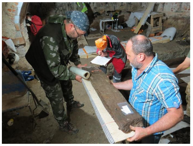
Fig. 6. Packing timbers for transport