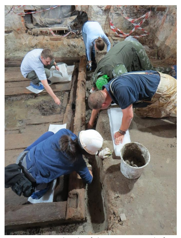
Fig. 2: Exposing details of the construction before dismantling