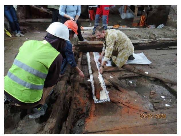
Fig. 4 and 5: Dismantling the construction