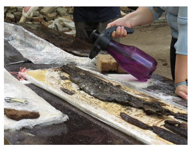
Fig. 7. Cleaning with water sprays