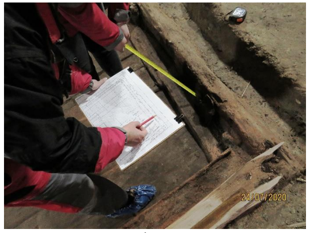
Fig. 3: Documentating the construction