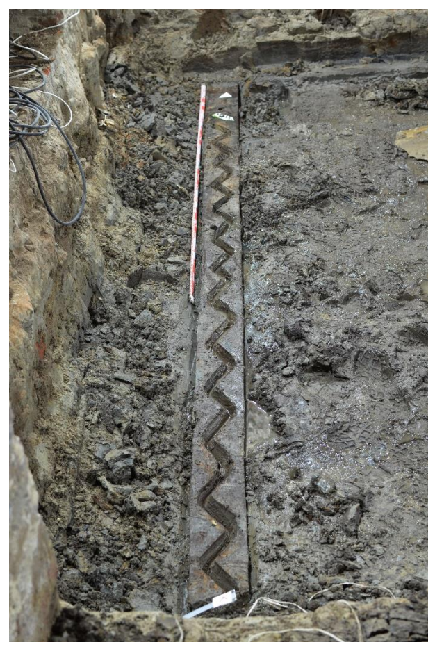
Fig. 9. Ground joist with carved design

After disassembling the lednik into its component parts, it became obvious that the details of other wooden constructions used in the lednik were possibly parts of ships and barges. For example, most of the floorboards correlated with the 2-inch ship deck boards (a "board type"—in English classification). Numerous fragments of iron nails and pegs (treenails), as well as holes left by them, were also discovered. One of the ground joists has a deep wave-shaped carving along its entire length (fig. 10). A copper 2 kopeks coin from the turn of the 18th century was found in the backfill of the pit under the hatch. That indicates that the log house operated for at least a 100 years.