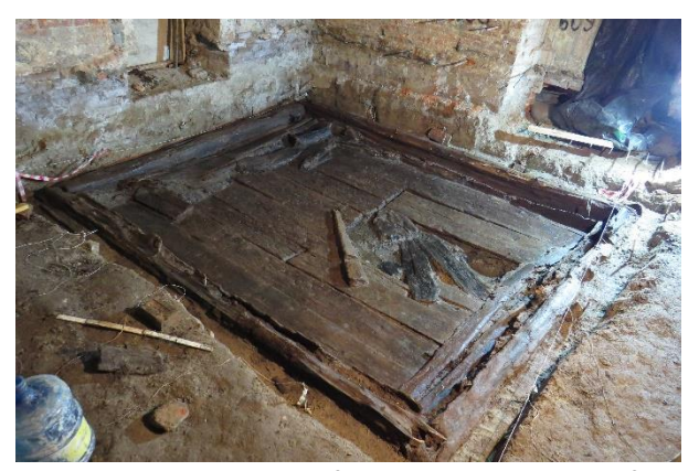
Fig. 1: General view of the ice-chamber before dismantling

During the restoration of the building of the 1st Cadet Corps in St. Petersburg, Russia, numerous artefacts have been discovered dating back to the 18-19th centuries. Among the large number of dish fragments, Dutch tiles, coins, fragments of military apparel, and architectural details, a wooden icechamber or "refrigerator" was also found (fig. 1). The historical building where the restoration works were carried out is the West Wing of the Palace of Alexander Menshikov, a friend and assistant of Peter the Great (1672-1725). The building was handed over to the First Cadet Corps in 1731. The existence of such constructions in the basement of the building is mentioned in written documents from 1730.