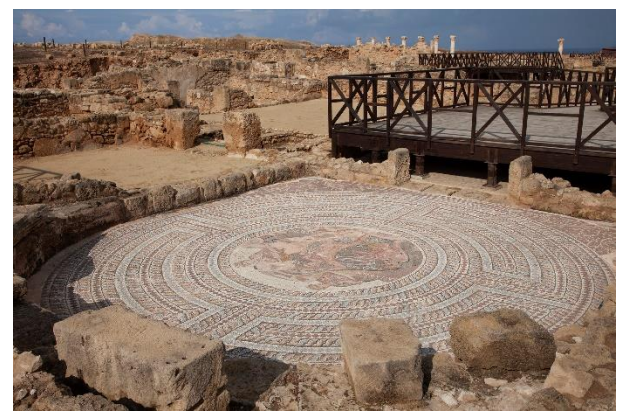
The Theseus mosaic.

The shortlist for a competition to design protective shelters at the World Heritage site of Nea Paphos (or Nea Pafos) was recently announced. As part of the Nea Paphos Conservation and Management Project, a collaboration between the Getty Conservation Institute (GCI) and the Department of Antiquities in Cyprus (DoA), a Call for Expression of Interest from architectural design firms worldwide was issued in fall 2019.