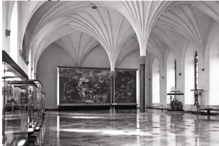
Figure 1: The exhibition of “The Battle of Grunwald” by Jan Matejko in The Great Refectory in 1977.

All the elements associated with the Teutonic Order and its glorification were either hidden or removed and the same fate befell other “German souvenirs”, such as the ‘Last Supper’ painting in the Convent Refectory. In judging those actions one must take into account the trauma of the war and earlier anti-Polish policies in 19th century Prussia, when it occupied part of Poland after the partitions that removed the country from the European political map. In that vein, the perception of the Order’s role was negatively told both by historians and the works of numerous Polish novelists and artists. This general anti-German sentiment was exploited and fueled by Poland’s Communist regime (fortunately much less radical than the Kremlin that ordered, for example, complete demolition of the burnt-out Teutonic castle in Königsberg, regarded as a jarring symbol of Prussian militarism).