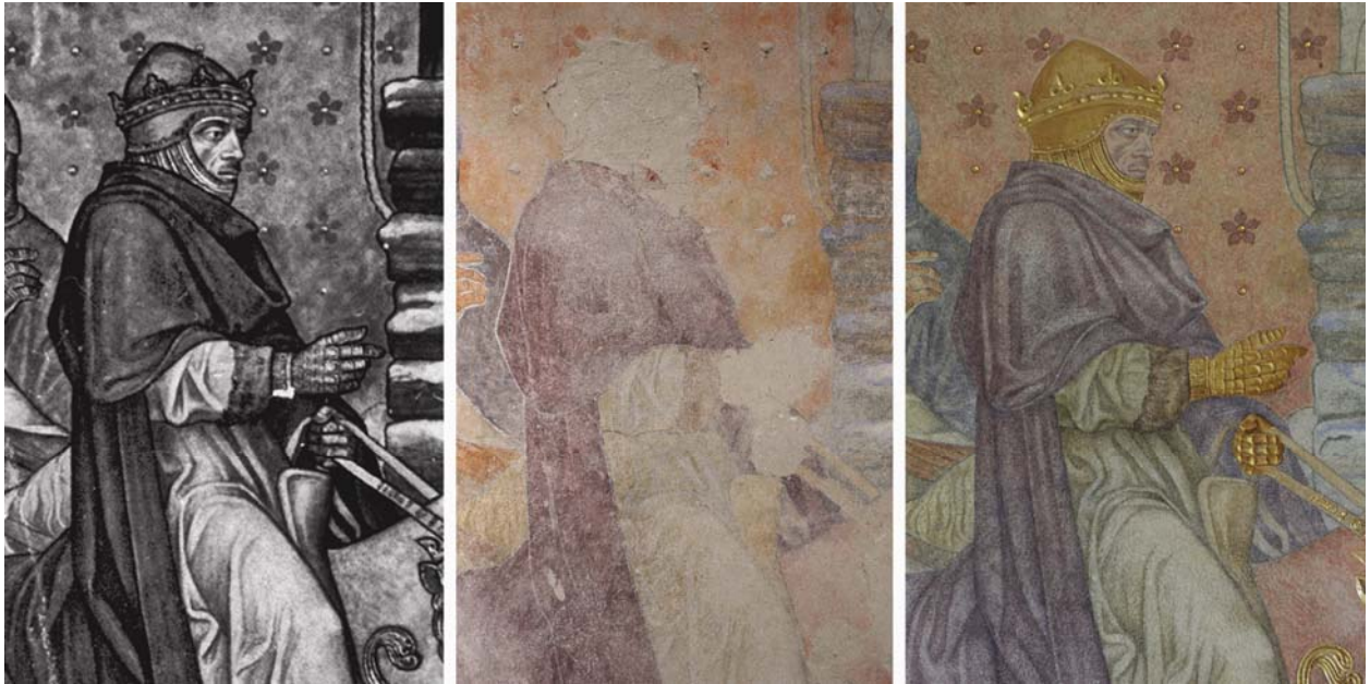
Figure 7: Detail of Hermann Schaper's painting on the north wall of The Great Refectory. From the left – in 1916, after the cleaning, after the end of the reconstruction works.