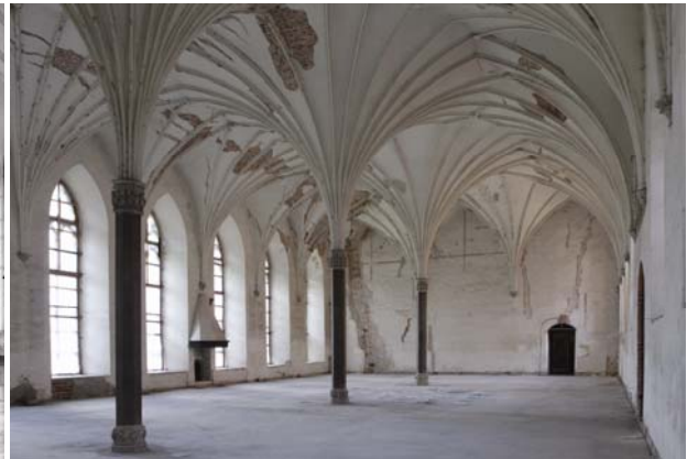
Figure 6: The Great Refectory before the beginning of conservation and restoration works in 2005.

The floor in the room was made of concrete with under-floor heating. It replaced a marble floor, removed during the foundation reinforcement works.