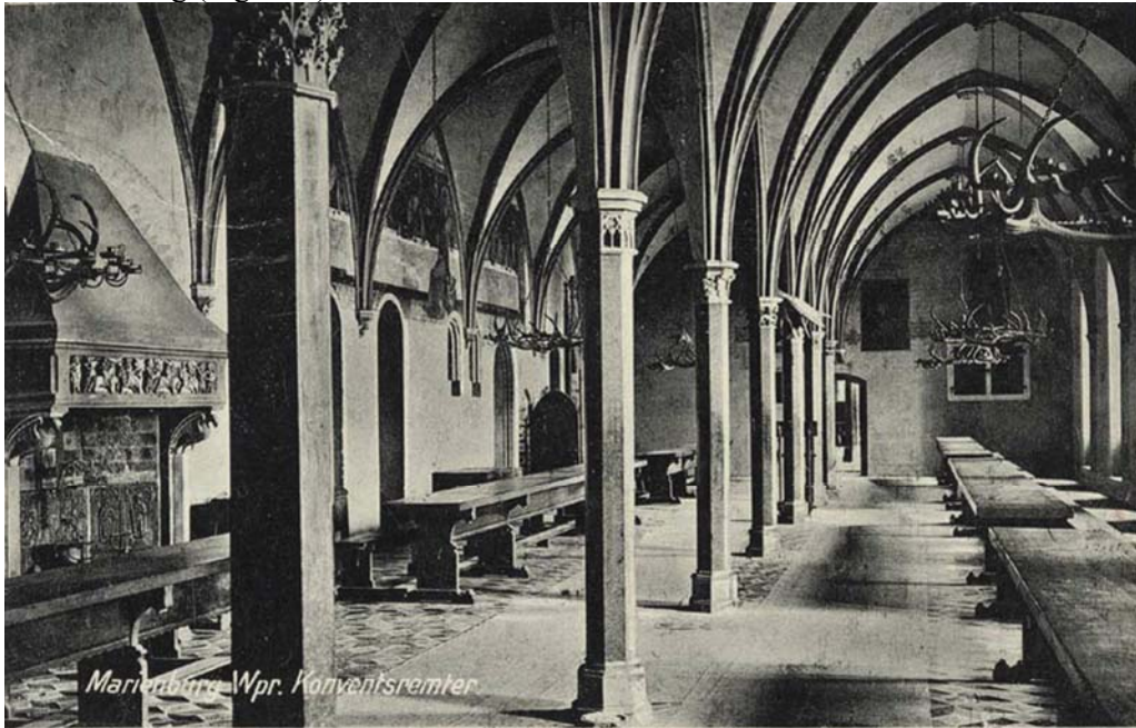
Figure 2: The Convent Refectory at the turn of the 19th century. Postcard from the archive of The Malbork Castle Museum.

In 1894 the east wall of the Refectory was decorated with the coats of arms of the Kaiser, his consort and the king of Wirttemberg (Figure 2).