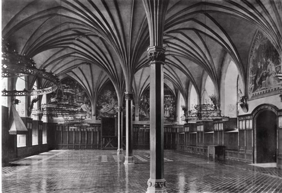
Figure 3: The Great Refectory in 1916, after the end of the Steinbrecht's works.

Steinbrecht's work in the Great Refectory is particularly interesting because of its wide scope. The paintings he commissioned corresponded with earlier Gothic decoration, the remainder of which he found in the middle arcade of the north wall. It was a three-part composition depicting the Order's raids into the Old Prussia. Style-wise, the new scenes were in line with the former Gothic paintings, but showed the conquest of the pagan Old Prussia by the Order as a national war. Steinbrecht's creation, realised after the outburst of the 1st World War, was an apotheosis of mission and conquest. The imperial ideology and its drive to impose German civilisation on the people of Vistula Lagoon area, was at the heart of Steinbrecht's decoration design in the Great Refectory (Figure 3).