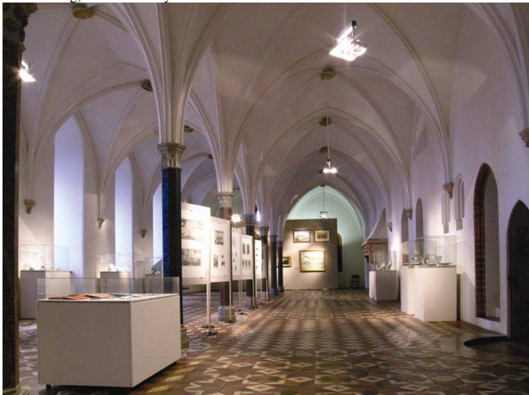
Figure 4: The Convent Refectory before the beginning of conservation and restoration works in 2005.

Crucial for the reconstruction of the furniture, especially the tables from the Refectory, were Steinbrecht’s original design, saved fragments, which underwent dendrochronological tests, and pre- and post-war photographs. Experts examined similar medieval tables that served as models for Steinbrecht’s design, located in Lueneburg, Lower Saxony.