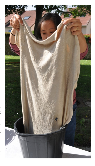
Fig.4 Tanning with brains.

and rubbing it energetically over a cable or the edge of a piece of wood. The result is an incredibly soft and elastic white skin that can be used to make clothes, among other things.