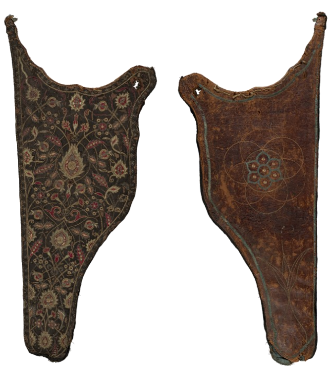
Fig.1. The bow case, front and back (right). © Célia Marty

A bow case from the Ottoman Empire (Fig.1) underwent a study and conservation treatment, as a thesis subject, at the Institut national du patrimoine (National Institute for Heritage) in France. The object is dated from the second half of the 16<sup>th</sup> century. It was conserved at the Musée de l'Armée (Military Museum) in Paris.