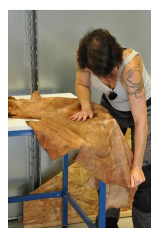
the Fig.3 softening the ving leather with mechanical skin action.

For tanning with animal fats, Dr Emmerich Kamper stressed the importance of removing the top layer of skin