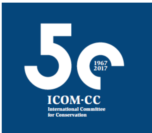
ICOM-CC 50TH ANNIVERSARY LOGO