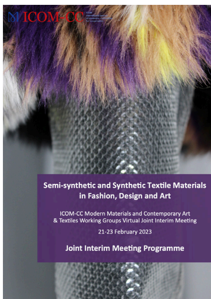
Cover of the joint Interim Meeting program. Layout: Julia Langenbacher

The event was indeed a success and created a lot of positive feedback. The total number of registered participants was 651, with 58 countries and 6 continents represented. There were 62 registrants from ICOM country categories 3 and 4 , whose participation was facilitated with the help of the AKC Fund, which supported the publication, enabling the event to be free and open to all who wished to attend. The postprints for the meeting will be available in open access form on the ICOM-CC Publications Online platform in 2024.