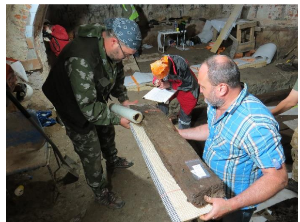
Fig. 6. Packing timbers for transport