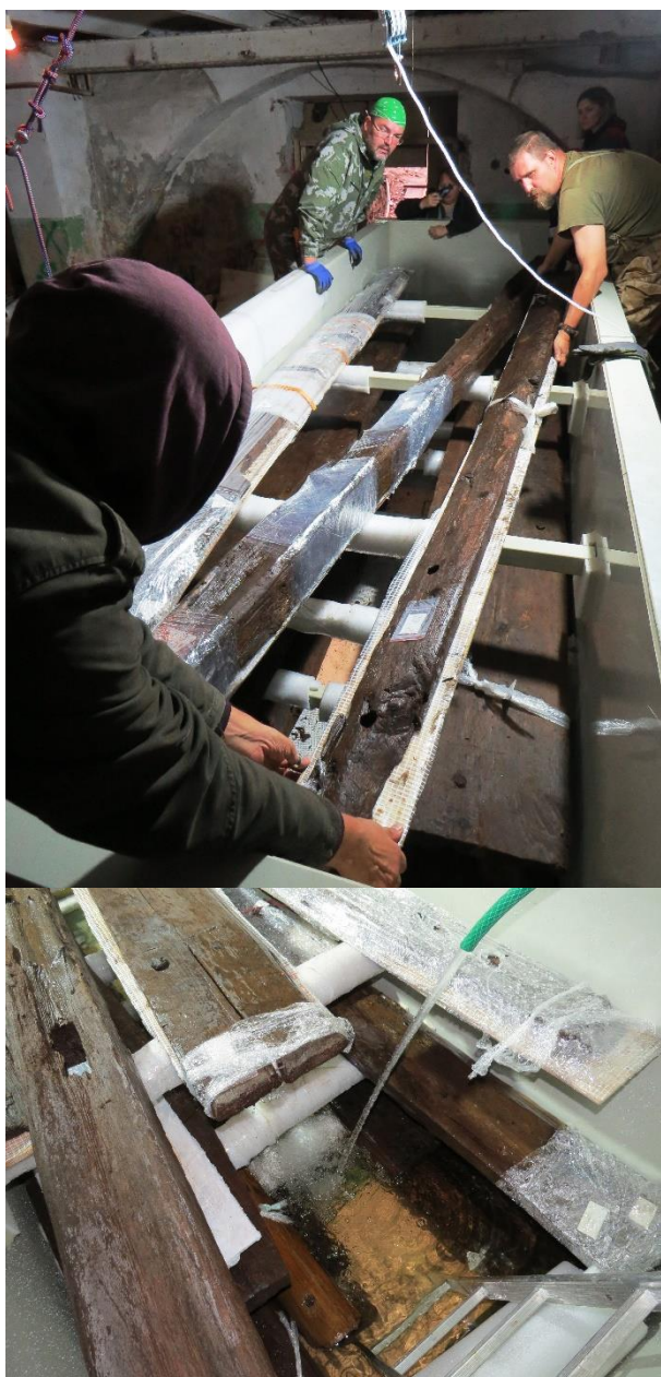
Fig. 8 and 9: Temporary storage in water tanks

After disassembling the lednik into its component parts, it became obvious that the details of other wooden constructions used in the lednik were possibly parts of ships and barges. For example, most of the floorboards correlated with the 2-inch ship deck boards (a “board type”—in English classification). Numerous fragments of iron nails and pegs (treenails), as well as holes left by them, were also discovered. One of the ground joists has a deep wave-shaped carving along its entire length (fig. 10). A copper 2 kopeks coin from the turn of the 18th century was found in the backfill of the pit under the hatch. That indicates that the log house operated for at least a 100 years.