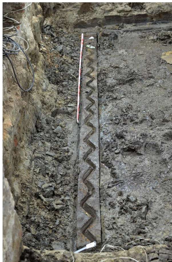
Fig. 9. Ground joist with carved design

After disassembling the lednik into its component parts, it became obvious that the details of other wooden constructions used in the lednik were possibly parts of ships and barges. For example, most of the floorboards correlated with the 2-inch ship deck boards (a “board type”—in English classification). Numerous fragments of iron nails and pegs (treenails), as well as holes left by them, were also discovered. One of the ground joists has a deep wave-shaped carving along its entire length (fig. 10). A copper 2 kopeks coin from the turn of the 18th century was found in the backfill of the pit under the hatch. That indicates that the log house operated for at least a 100 years.