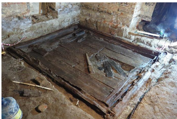
Fig. 1: General view of the ice-chamber before dismantling

During the restoration of the building of the 1st Cadet Corps in St. Petersburg, Russia, numerous artefacts have been discovered dating back to the 18-19th centuries. Among the large number of dish fragments, Dutch tiles, coins, fragments of military apparel, and architectural details, a wooden ice-chamber or "refrigerator" was also found (fig. 1). The historical building where the restoration works were carried out is the West Wing of the Palace of Alexander Menshikov, a friend and assistant of Peter the Great (1672-1725). The building was handed over to the First Cadet Corps in 1731. The existence of such constructions in the basement of the building is mentioned in written documents from 1730.