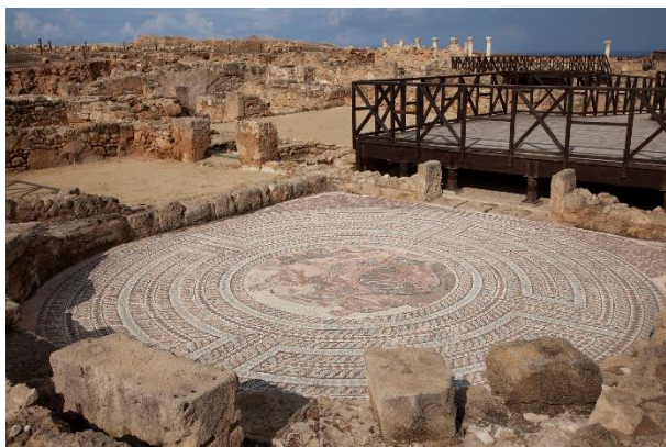
The Theseus mosaic.

The shortlist for a competition to design protective shelters at the World Heritage site of Nea Paphos (or Nea Pafos) was recently announced. As part of the Nea Paphos Conservation and Management Project, a collaboration between the Getty Conservation Institute (GCI) and the Department of Antiquities in Cyprus (DoA), a Call for Expression of Interest from architectural design firms worldwide was issued in fall 2019.