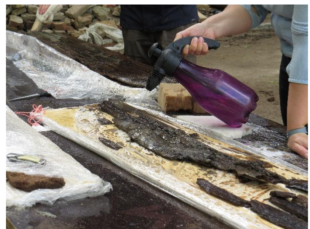
Fig. 7. Cleaning with water sprays