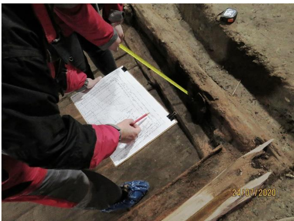
Fig. 3: Documentating the construction