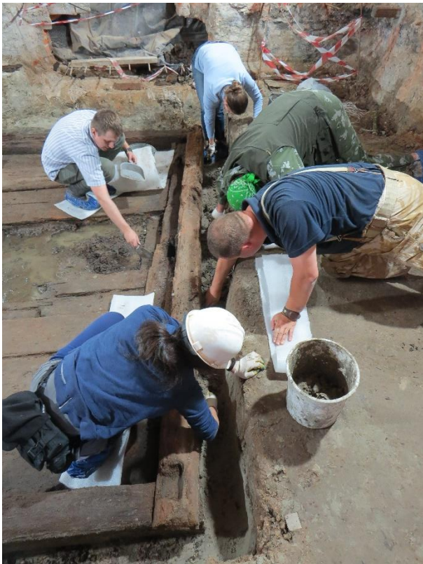
Fig. 2: Exposing details of the construction before dismantling