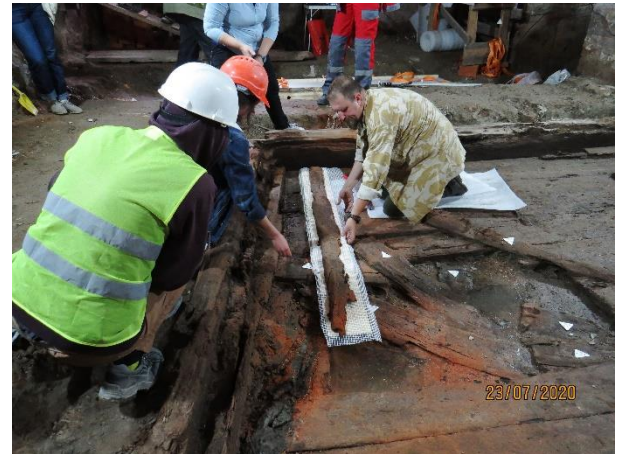
Fig. 4 and 5: Dismantling the construction