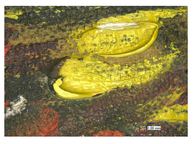
Detail, yellow impasto, (Apocalyptic Landscape)

The painting was strip lined and stretched on a simple wooden stretcher reinforced with aluminum profiles. A total of 18 knurled head screws were embedded in the four sides of the stretcher frame thereby allowing a stepless readjustment of the canvas tension when positioned in the outer frame.