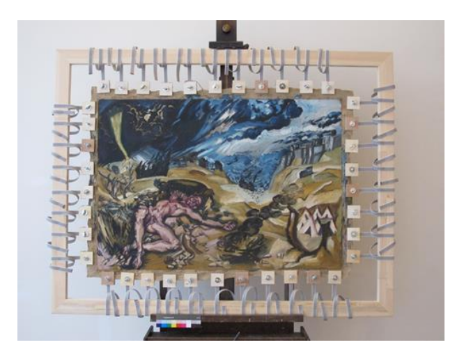
Canvas stretched on a temporary work frame.

The conservation research undertaken made it possible to define specific characteristics of the techniques employed by the artist as well as determining the genesis of the work (which side was painted first) and details of the painting process.