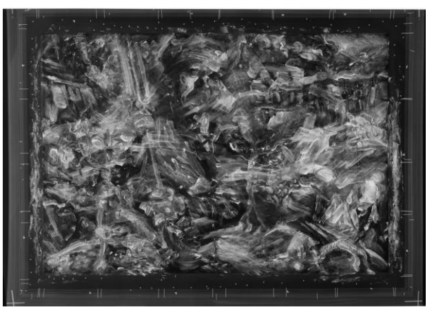
X-ray fluorescence image before removal of the canvas from its non-original frame. Staatliche Museen zu Berlin. Christoph Schmidt.

O trabalho de restauro desenvolvido teve uma natureza interdisciplinar e compreendeu uma equipa de conservadores, curadores, cientistas da conservação e especialistas de mecatrónica. O objectivo, além da conservação da pintura, era o de criar uma estrutura nova e adequada, com um sistema integrado de tensionamento da tela e que permitisse a exibição simultânea de ambos os lados da obra.