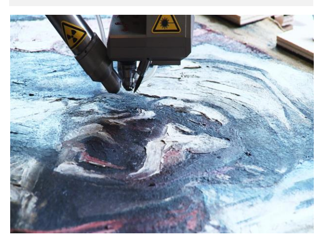
The paint layer has been analysed using micro X-ray fluorescence analysis (micro-XRF).

Um desafio importante durante o decurso do trabalho foi o de desenvolver uma grade e moldura adequadas, que permitissem a exibição simultânea dos dois lados da obra e a minimização das vibrações da tela.