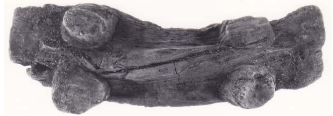
The underside of the Key Marco stool in 2015 and the 1970s.