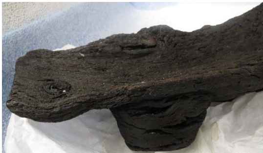
The Key Marco stool in 2015.

While the treatment of the stool was successful, it is important to note that this object would likely have been conserved differently today. There have been a few advances in PEG preservation since Purdy conserved the stool in the 1970s. The first is that there have been changes in the molecular weight used. PEG comes in a variety of molecular weights. PEG 1000, which is what Purdy used, has an average molecular weight of 1000. As mentioned earlier, studies have shown that if PEG with too high a molecular weight is used, it does not fully penetrate the object and the object may later deteriorate, crumbling at the core. Compounding this problem is the fact that different types of woods are denser than others. Therefore, many PEG treatments either include the use of low molecular weight PEG such as PEG 400 or use PEG 2000 alone.