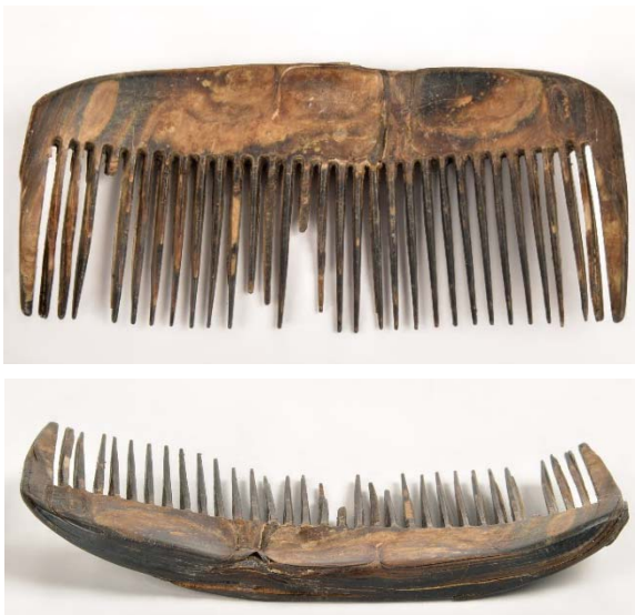
Fig. 3 Horn comb after treatment.