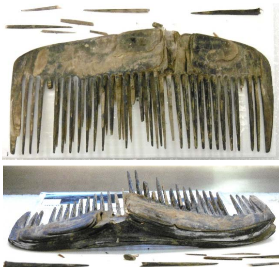
Fig. 1 Horn comb appearance at 85% HR during the slow drying process.

The comb was in a medium state of preservation. It had some cracks and light flaking but the needle test indicated that we had a very hard and impenetrable material. After impregnation in Polyethylene Glycol 400 (20% v/v) we performed a slow air drying. Three weeks later while the object was at 85%RH we observed deformation and exfoliation beginning. The material had also lost its flexibility, so it was not possible to regain its original shape by applying pressure without breaking it. We thought about using thermoplastic proprieties of keratinaceous materials to reshape the comb, but we didn't manage to identify the exact temperature at which it should be performed with such archaeologically damaged material.