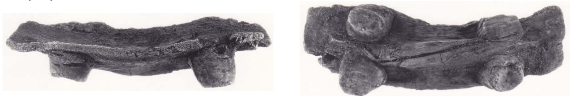
The Key Marco wooden stool/headrest in the 1970s.

In 1972, Purdy decided to use PEG 1000 for an experimental conservation on a wooden stool (or possibly headrest) from the Key Marco Collection that was warped, cracked, and disintegrating. Purdy chose the Key Marco wooden stool (FLMNH catalog number A5646.140538) for this experiment because the object was in poor condition. Purdy (1974) states, “The stool had become so fragile that it was nearly impossible to handle it without pieces splintering off.” 2 She also selected this particular object because Cushing’s original report included a drawing of the stool, its measurements, and a detailed description. Purdy’s results, which compared Cushing’s original measurements with her pre- and post- treatment measurements, were published in American Antiquity in 1974.